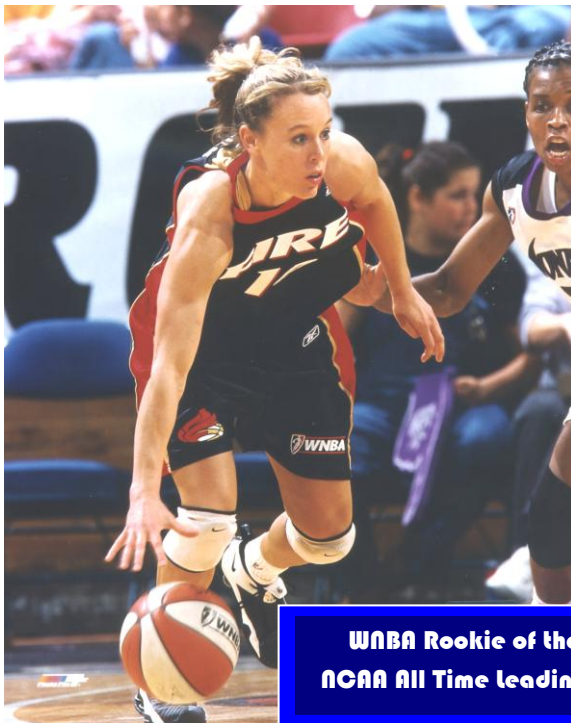
WNBA Rookie of the Year NCAA All Time leading Scorer

June 29-July 2 Springfield, MO July 18-21 Portland, OR August 3-6 Philadelphia, PA